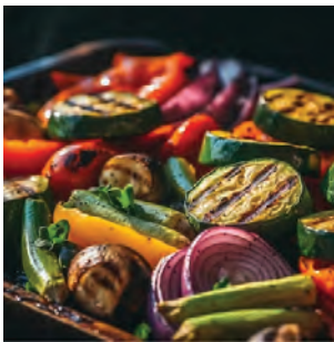
Veggie Bar | $5pp