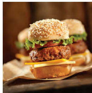
Slider Bar | $11pp