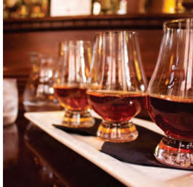
Scotch Tasting starting at $500