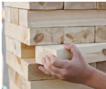
Giant Jenga | $100