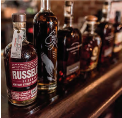
Bourbon Tasting starting at $500

Choose from our most popular options or work with your event specialist to achieve your vision.