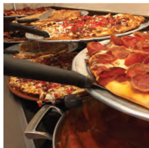
LaRosa's Pizza | $8pp