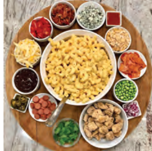
Mac & Cheese Bar | $9pp