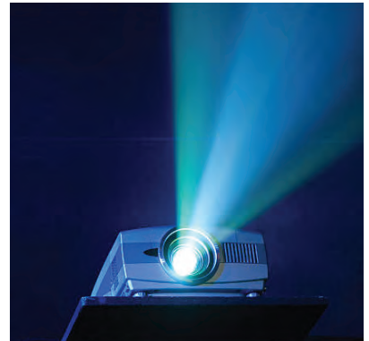
Projector/AV starting at $100