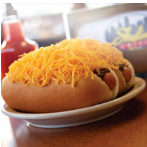
Skyline Chili | $8pp