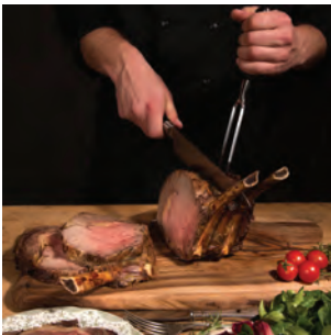
Carving Station | $55pp