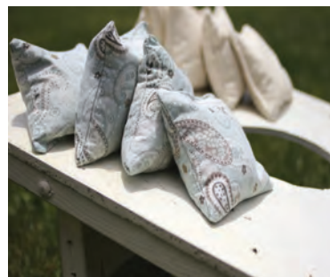
Cornhole Sets | $100