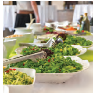
Salad Station | $5pp