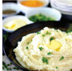
Mashed Potato Bar | $9pp