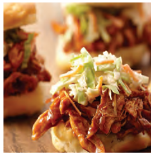
Backyard BBQ | $10pp