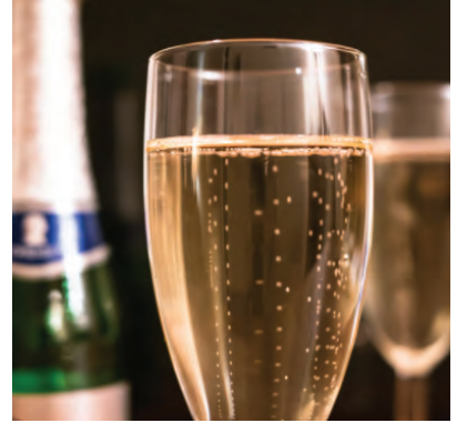
Champagne Toast | $4pp