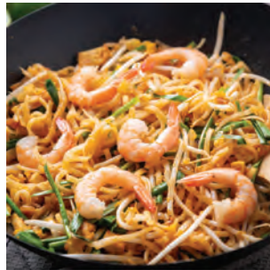
Pad Thai Station | $17pp (minimum of 40 guests)