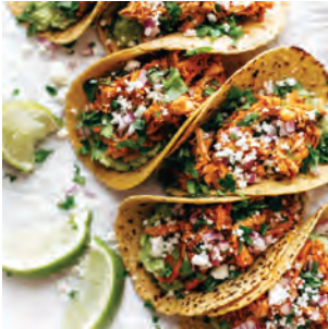
Taco Bar | $13pp

Our Signature Stations are popular for cocktail hours, late night bites or as a creative dining option. Choose from our guest favorites or work with your event specialist to customize a menu.