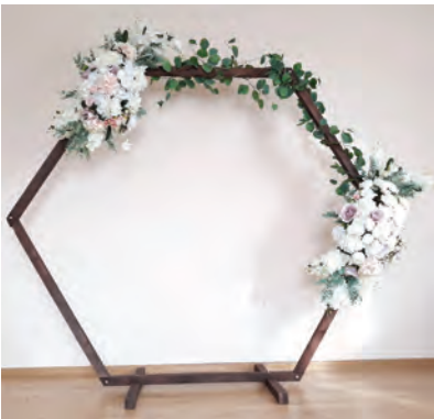
Arch Rental | $100