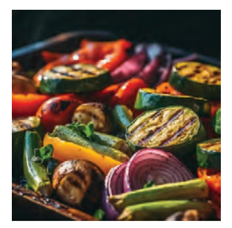
Veggie Bar | $5pp