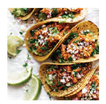
Taco Bar | $13pp

Our Signature Stations are popular for cocktail hours, late night bites or as a creative dining option. Choose from our guest favorites or work with your event specialist to customize a menu.