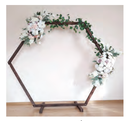
Arch Rental | $100