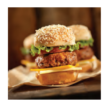
Slider Bar | $11pp