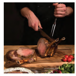
Carving Station | $55pp