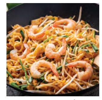
Pad Thai Station | $17pp (minimum of 40 guests)