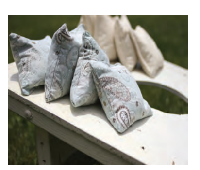
Cornhole Sets | $100