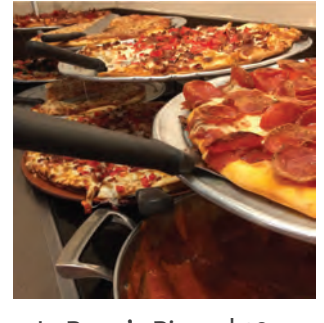
LaRosa's Pizza | $8pp