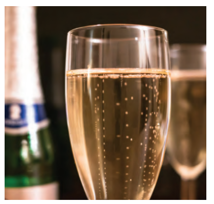
Champagne Toast | $4pp