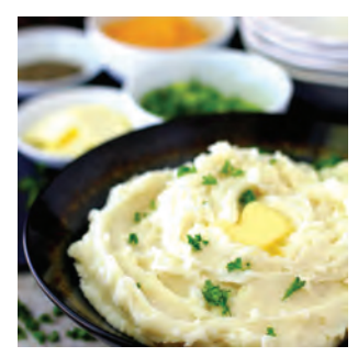
Mashed Potato Bar | $9pp