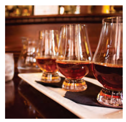
Scotch Tasting starting at $500