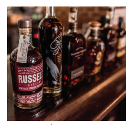
Bourbon Tasting starting at $500

Hosting an exceptional event is all in the details. Utilize these additions to make your event unforgettable. Choose from our most popular options or work with your event specialist to achieve your vision.