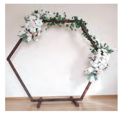
Arch Rental | $100