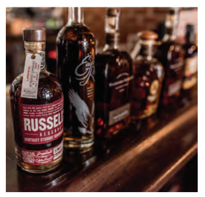
Bourbon Tasting starting at $500

Hosting an exceptional event is all in the details. Utilize these additions to make your event unforgettable. Choose from our most popular options or work with your event specialist to achieve your vision.