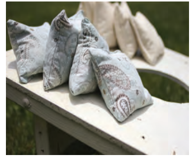
Cornhole Sets | $100