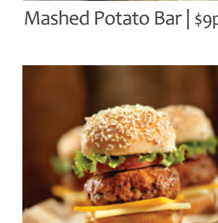
Slider Bar | $11pp