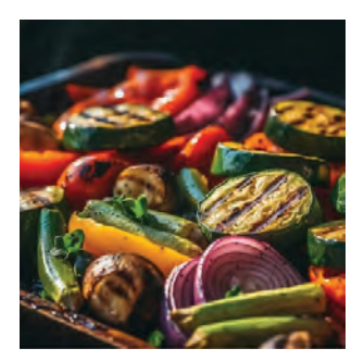
Veggie Bar | $5pp