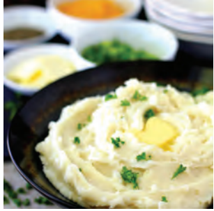
Mashed Potato Bar | $9pp