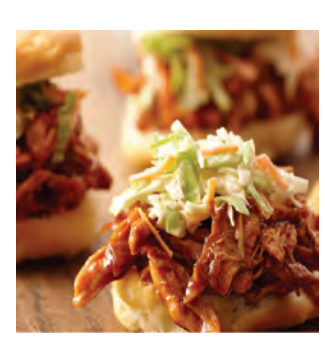
Backyard BBQ | $10pp