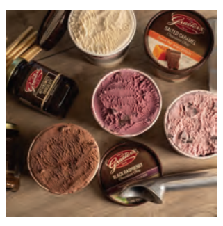
Graeter's Ice Cream | $7pp

The Backstage Event Center | 625 Walnut Street | Cincinnati, OH | 45202 | 513.550.1869 | backstagecincinnati.com