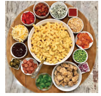
Mac & Cheese Bar | $9pp