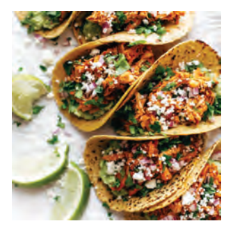
Taco Bar | $13pp

Our Signature Stations are popular for cocktail hours, late night bites or as a creative dining option. Choose from our guest favorites or work with your event specialist to customize a menu.