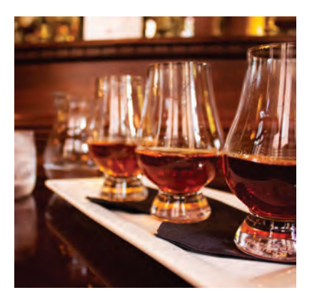
Scotch Tasting starting at $500