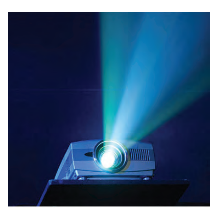
Projector/AV starting at $100