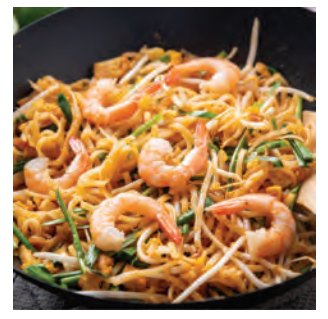
Pad Thai Station | $17pp (minimum of 40 guests)