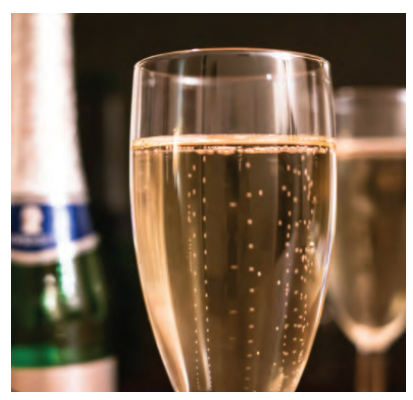
Champagne Toast | $4pp