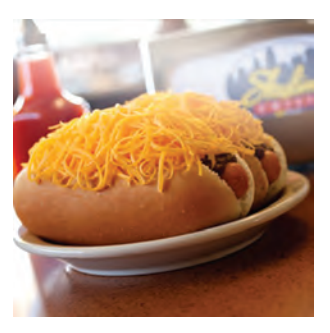
Skyline Chili | $8pp